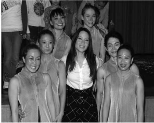
H.T. Chen & Dancers with Lucy Liu at the premiere of Between Heaven and Earth at I.S. 131.

H.T. Chen & Dancers' collaboration with the Orchestra of St. Luke's was an enormous success. With eight shows in four days of performances, the company was able to reach over 9,000 young audiences with their new premiere, Between Heaven and Earth , with music by renowned composers Chen Yi and Zhou Long.